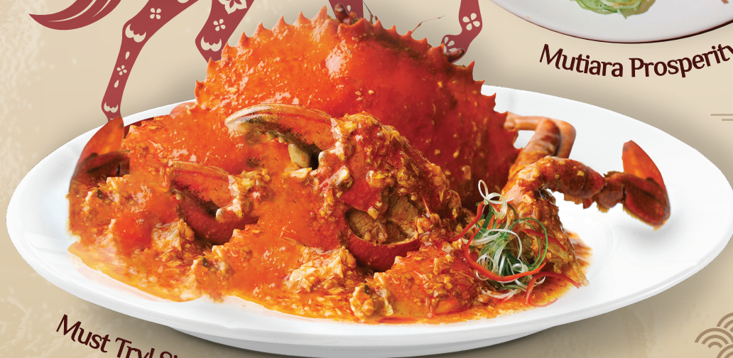
Must Try! Signature Chili Crab