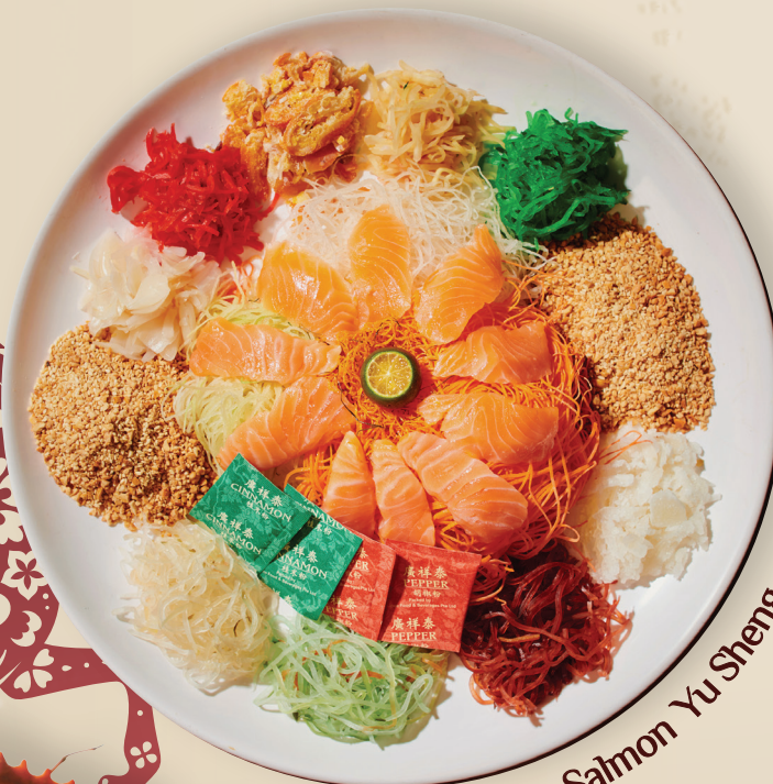
Mutiara Prosperity Salmon Yu Sheng

马到成功 好运相随 GALLOPING STEED, CREATING NEW HORIZONS.