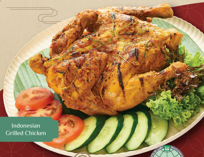
Indonesian Grilled Chicken