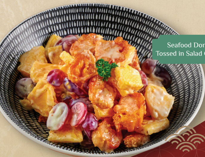
Seafood Donut Tossed in Salad Cream